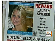
Missing student's body may have been found