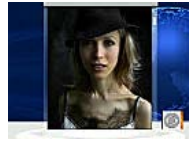
French writer to sue DSK for alleged 2003 assault