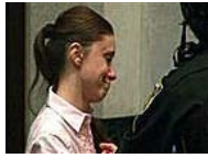
Raw Video: Casey Anthony Acquitted of Murder