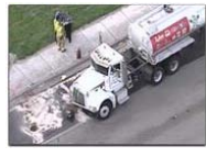
Raw Video: Bus, Tanker Collide in Fla.