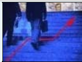
Hot Stock Pick - OMVS Solar Automotive Technology. Investment, Stocks, Trade

NOTE: Your inbox must accept emails from "no-reply@gatehousemedia.com"