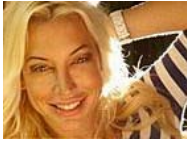
Aruba Mystery: Suspect's Legal, Financial Problems