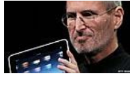
Steve Jobs quits as Apple boss