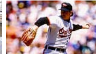
Former Orioles Pitcher Mike Flanagan Found Dead