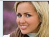
Banks Forced to Forgive Credit Card Debt Find Out How Much of Your Debt Can Be Settled!