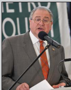
Speaker of the House Robert DeLeo at the Chamber Legislative Luncheon held at Bridgewater State College in April.